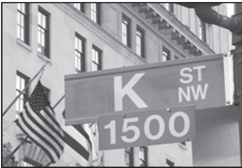
"K Street" is commonly used to describe lobbyists in Washington, DC. Many of the major lobbying groups have offices on this street.