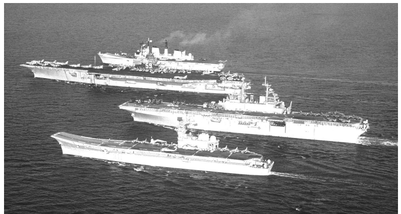
American, British, and Spanish ships participate in a North Atlantic Treaty Organization (NATO) military exercise.

“Inter” means among or between . It is a prefix that shows there is a connection between things. Intergovernmental organizations are organizations that are formed between governments. They are based on formal agreements between three or more countries that have come together for a specific purpose. For example, several governments might come together to share the national experts and resources to develop solutions for fighting hunger around the world.