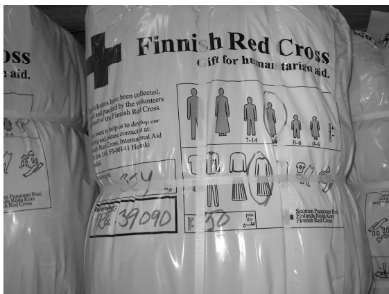
A bundle of clothes from the Red Cross in Finland waits to be donated to people in need.