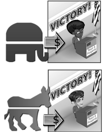
Political parties donate lots of money to help their candidates.

At the same time, political parties fight hard to get candidates from their party elected. Every four years, the national committees for the two major parties must nominate candidates to run for President and Vice-President. At the state level, state committees push to support candidates for the U.S. Senate and the House of Representatives, as well as for the state's own legislature. Political parties also have local branches that work on behalf of candidates for offices at the county and city levels.